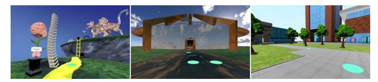
Fig. 7. From left to right, three studies use Circles to create a symbolic memory palace for an introductory cognitive science course, a community co-design study with a local indigenous group, and a virtual recreation of a university campus.

Researchers created a Circles world for use within cognitive science classrooms to help students understand the function of parts of the brain as illustrated metaphors [38]. Other researchers collaborated with a local indigenous group to explore how to co-design VR content [39]. Another project is re-creating a university campus. These projects helped researchers better understand how to support new creators [12]. They were essential in helping researchers better document the setup process and identify new Circles' components for development.