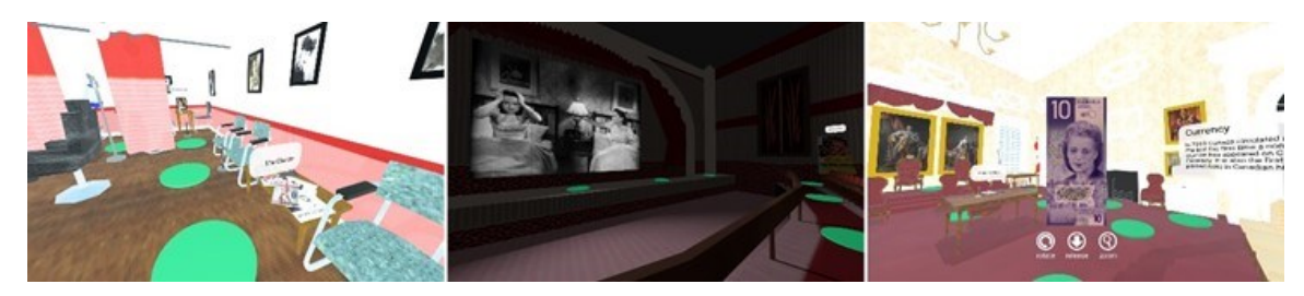
Fig. 4. Developers created three Circles' worlds to describe Viola Desmond's story.

Viola Desmond was a Canadian Civil Rights pioneer, and researchers worked to help tell her story during Circles' initial design and development [24]. The original HMD target was the low-powered Oculus GO, with one controller and no positional tracking. Thus, much of the initial work focused on optimizing worlds for low-powered devices, simplifying interactions, and defining a 3D asset creation workflow. Researchers observed that users found the storytelling-based VLAs engaging during development. Hence, Circles' researchers developed the "circles-artefact" component to help encourage creators to implement VLAs/Artefacts in future projects.