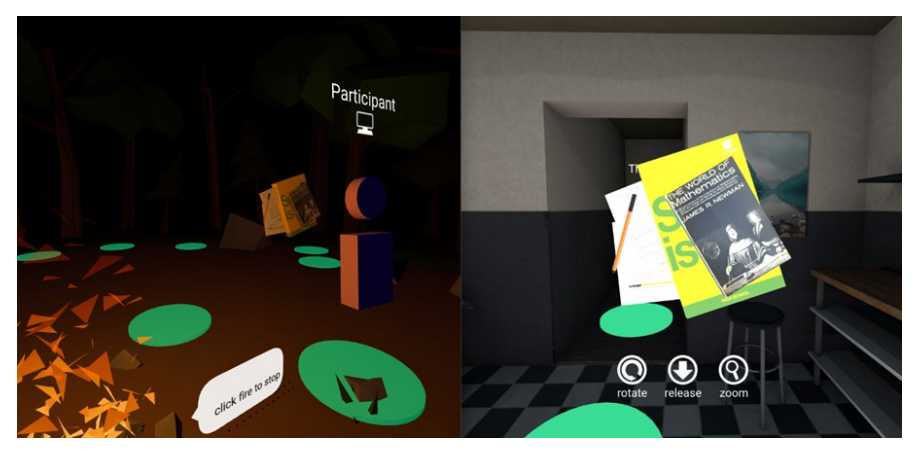
Fig. 1. An example of "Multi-world" interactions where learners can see each other and share VLAs from different worlds (note the homework VLA present in both VLEs).

3. Exploring an Alternate VR Learning Framework. Many social VR platforms focus on communication and recreational contexts [32]. However, it is unclear why developers made the underlying design decisions for many of these social VR experiences [18, 31]. By building a new ground-up approach to creating a VR learning framework, Circles' researchers can more methodically document the VR learning design process and question underlying assumptions about using VR within social learning spaces from a socio-cultural perspective.