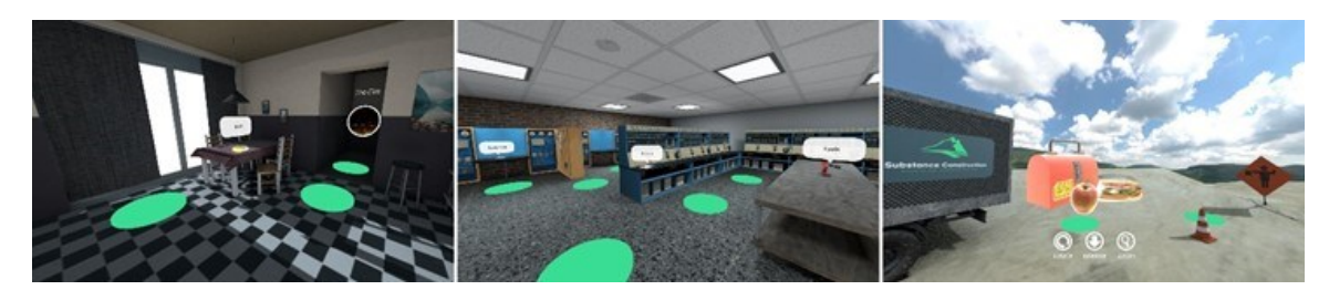
Fig. 5. Creators created three Circles' VLEs to highlight women's trade challenges.

These VLEs were created for a PSE faculty workshop highlighting women's challenges in the trades. Developing assets for a more powerful HMD (Meta Quest 1) allowed creators to implement higher-resolution textures and 3D models. Creators designing and developing VLES and VLAs taught researchers how to work with inclusion and subject matter communities to design VR content and better refine Circles' documentation, components, and content creation pipeline. The authors are preparing a full paper detailing the results of a study conducted using these environments.